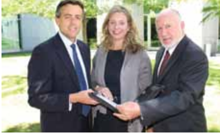
Member for Gippsland Darren Chester and Member for Mallee John Forrest welcome new Victorian Nationals Senator Bridget McKenzie to Canberra.